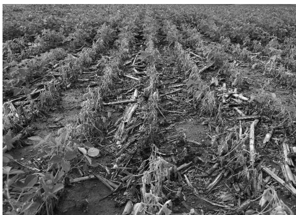
phytophthora stem rot

Maturity: An analysis of soybean yield and maturity data from the 2009-2016 Michigan Soybean Performance Reports showed that maturity has little effect on soybean yields when the highest-yielding varieties are selected within the adapted maturity range for the area and planted in mid to late May. The analysis also showed that on average, soybean harvest operations are delayed by one day for each 0.1 increase in soybean maturity group. Planting varieties from a range of adapted soybean maturity groups is recommended.