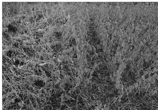
soybean variety effect on lodging

Quality: Producers should also consider quality characteristics when selecting soybean varieties. Some of our leading export markets demand soybeans consisting of 19 percent oil and 35 percent protein. As global competition increases, Michigan soybean producers will need to meet this standard to maintain access to these markets.