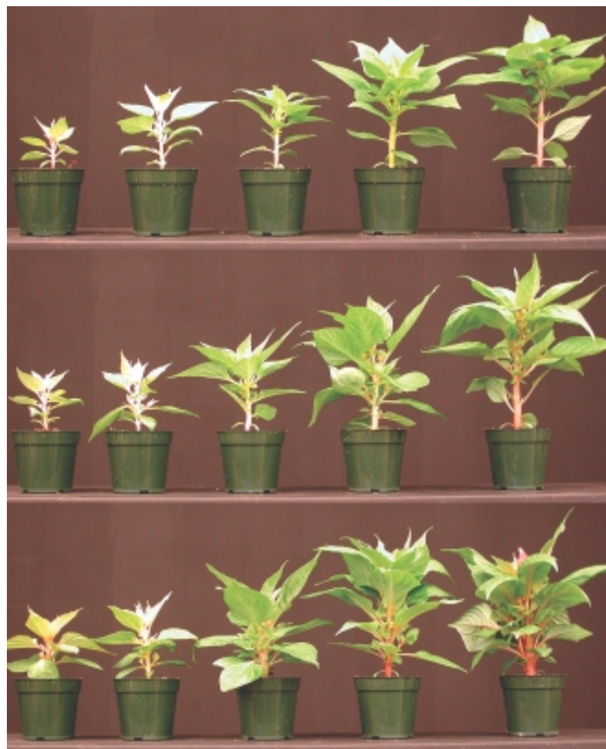
Figure 5. Growth and development of celosia during the finish stage, after 24 days (from transplant of a 288-cell plug) at various temperatures and under different daily light integrals. Average daily light integral from top to bottom: 6 \text{ mol} \cdot m^{-2} \cdot d^{-1} , 15 \text{ mol} \cdot m^{-2} \cdot d^{-1} and 21 \text{ mol} \cdot m^{-2} \cdot d^{-1} . Temperature from left to right: 57, 63, 68, 73 and 79° F.