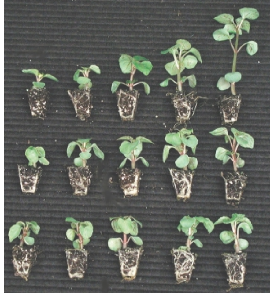
Figure 3. Growth and development of impatiens after 29 days at a range of temperatures and under different daily light integrals. Average daily light integral from top to bottom: 10 \text{ mol}\cdot\text{m}^{-2}\cdot\text{d}^{-1} , 20 \text{ mol}\cdot\text{m}^{-2}\cdot\text{d}^{-1} and 24 \text{ mol}\cdot\text{m}^{-2}\cdot\text{d}^{-1} . Temperature from left to right: 57, 63, 68, 73 and 79° F.