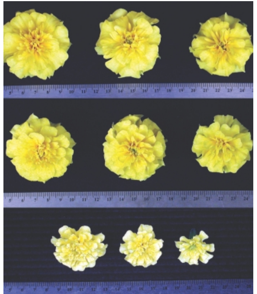
Figure 6. Marigold finish flower size observed at a range of temperatures and under different daily light integrals from left to right: high, moderate and low daily light integral. Temperatures from top to bottom: 57, 68 and 79° F.