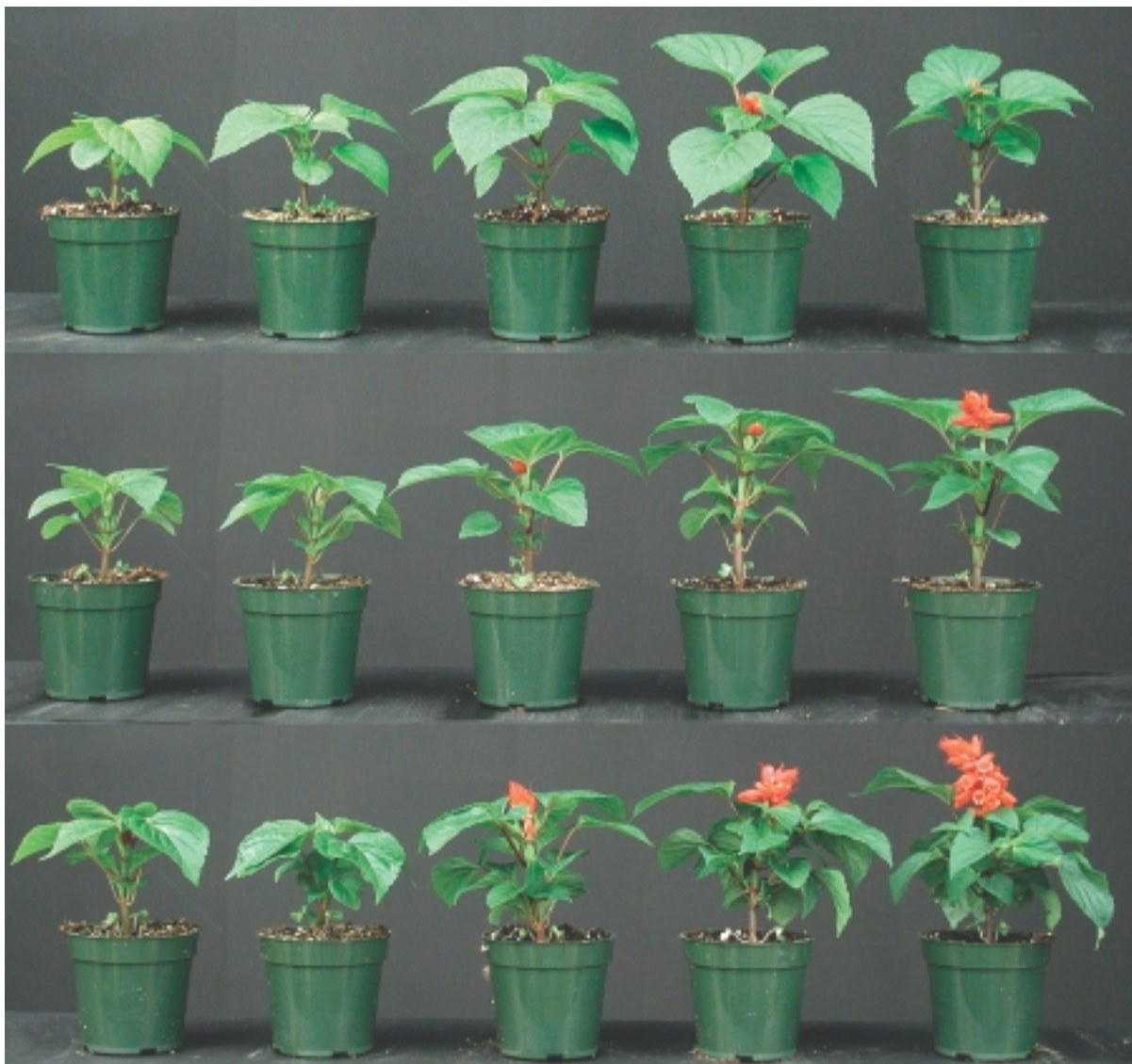
Figure 1. Growth and development of salvia during the finish stage, after 19 days (from transplant of a 288-cell plug) at various temperatures and under different daily light integrals. Average daily light integral from top to bottom: 6 \text{ mol}\cdot\text{m}^{-2}\cdot\text{d}^{-1} , 13 \text{ mol}\cdot\text{m}^{-2}\cdot\text{d}^{-1} and 20 \text{ mol}\cdot\text{m}^{-2}\cdot\text{d}^{-1} . Temperature from left to right: 57, 63, 68, 73 and 79° F.

Fuel prices continue to fluctuate, causing heartburn and headaches for growers as they receive their monthly fuel bills during periods of cold weather. When fuel costs are high, some growers in cold climates (such as the Northern United States) have lowered their greenhouse temperatures to reduce fuel consumption and thus reduce their monthly bill. However, the effect of such a temperature decrease on plant timing and plant quality has not been determined for many popular bedding plant species.