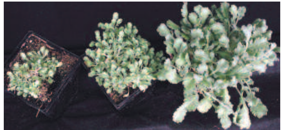
Top: Biweekly applications of 0, 0 (plus water), 400, 600 or 800 ppm Florel (left to right) on Coreopsis verticillata 'Moonbeam'. Bottom: Weekly applications of 0, 0 (plus water), 400, 600 or 800 ppm Florel (left to right) on Coreopsis verticillata 'Moonbeam'. Photos were taken 10 weeks after the start of Florel application and cuttings were harvested three times.