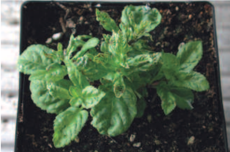
Phytotoxic effects on veronica foliage from weekly Florel applications at 600 ppm.

Coreopsis verticillata 'Moonbeam', Veronica spicata 'Sunny Border Blue', dianthus 'Cinnamon Red Hots', Salvia nemorosa 'May Night', Scabiosa columbaria 'Giant Blue' and Thalictrum kiusianum were