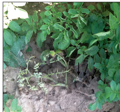
Figure 4. Aerial stem rot: Affected stem tissue become desiccated under dry conditions, resulting in a dry, brownish to black shriveled stem.