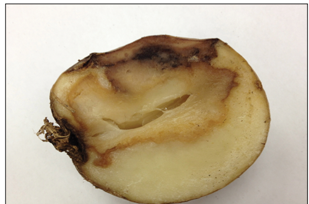
Figure 1. Tuber soft rot: Rotting tissue is mushy, slimy and water soaked; infected areas often turn brown or black around the rotting area upon exposure to air. (Michigan State University)

Tuber soft rot caused by Dickeya and Pectobacterium on infected potato exhibits small, cream to tan, water-soaked surface spots that progress inward. This decay can expand rapidly, resulting in rotting tissue that is mushy, slimy and water soaked (Figure 1). Infected areas of the tuber can become puffy, creating blister-like lesions that often ooze a watery substance. Upon exposure to air, infected areas often turn brown or black around the rotting area (Figure 1). Decay can occur rapidly under moist conditions in storage due to the development of a film of water resulting in anaerobic conditions in tubers and thus predispose for soft rots. The bacteria that initiate the disease are odorless, although secondary infection by other organisms can cause an unpleasant odor.