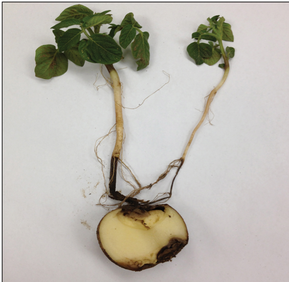
Figure 2. Blackleg symptoms progressing from the decaying seed piece to the base of the stem.

Blackleg is caused by either Dickeya spp. or Pectobacterium spp. Blackleg symptoms appear as black lesions at the base of the stem that can quickly girdle the stem as they expand upward. Unlike tuber soft rot, infected plant stems have a black appearance (Figure 2). Affected tissue becomes soft and water soaked under humid conditions. Infected stem lesions can rapidly expand causing brown to black decay that can affect the entire stem and lead to plant death. Affected plant stems appear stunted and leaves of infected plants become chlorotic and tend to roll upward at the margin as the disease progresses. Under dry conditions, symptoms are expressed as yellow, stunted and wilted plants with shriveled infected black tissue restricted to the area around the base of the stem near the soil surface.