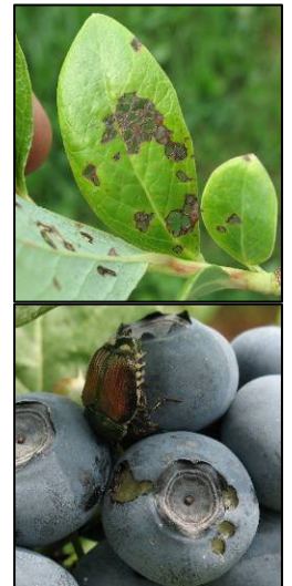
Top: Leaf feeding by Japanese beetle.

Begin scouting for Japanese beetle in mid to late June. Visually scan the canopy of 10 bushes on the field border and 10 bushes in the interior of the field. Count the number of beetles observed. As beetles are very mobile, check for the presence of feeding damage on leaves and fruit to let you know if beetles have been active in the field recently. See pictures above for examples of fruit and leaf feeding.