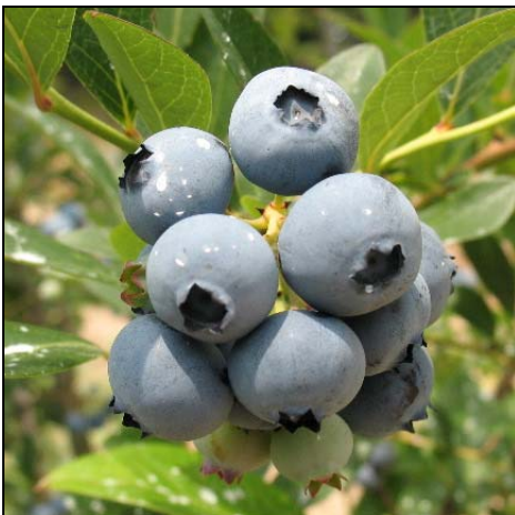
Rubel near first harvest at West Olive.

In Ottawa County, Blueray are within a week of first harvest in Holland. Rubel and Bluecrop are also within a week of first harvest in West Olive.