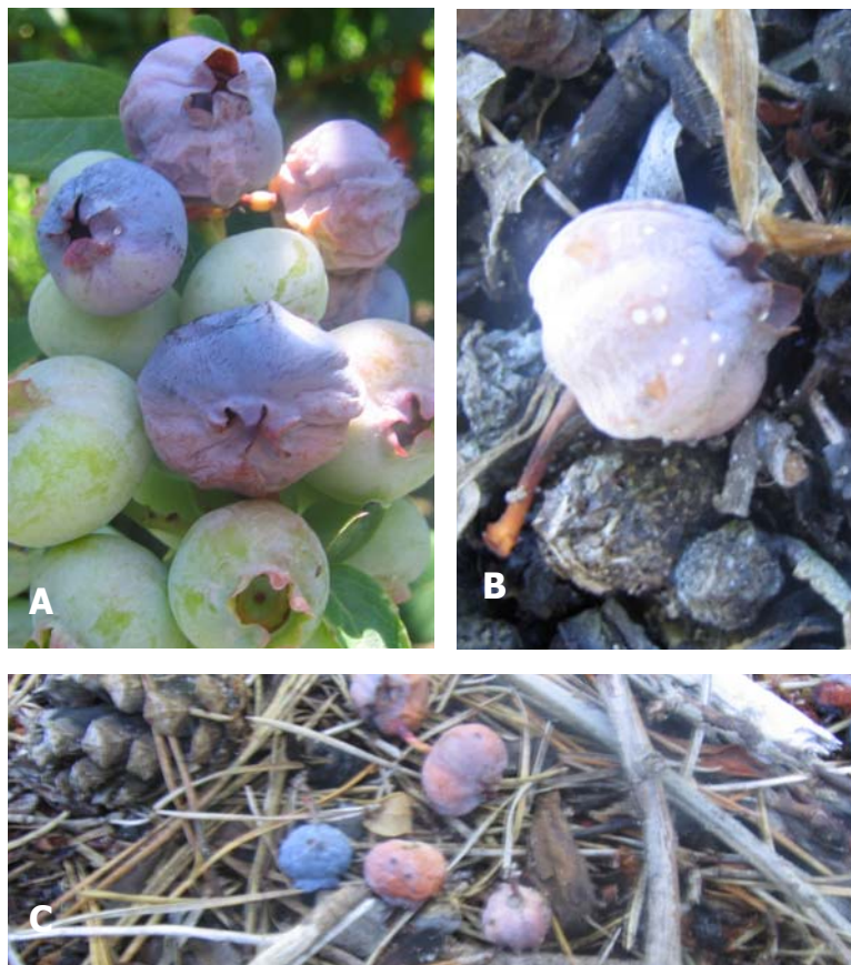
Figure 1. A) New mummy berries seen on a fruit cluster, turning tan or sometimes pinkish color during the “fruit coloring” stage. B) Mummies may also be located on the ground during the same time period. C) It is important to scout on the bush and on the ground. (Holland, MI)

Mummy berry is one of the most economically important blueberry diseases in Michigan as there is usually a zero tolerance for mummified fruit in processed berries. In earlier issues, we have extensively covered life cycle, symptoms, and effective management strategies for this disease. This week, we will focus on symptoms and scouting for this stages of infection. The first external symptoms of fruit infection are a tan-brown to pink discoloration of fruit. In the later stages, the fruit becomes shriveled with shallow ridges (Figure 1 and 2) and may fall to the ground. When scouting for mummy berries, it is extremely important to not only scout on the bush but also on the ground as mummies tend to detach from the cluster prematurely. They are easier to see when the ground is clear of weeds and debris. The amount and location of the mummy berries gives us an insight into where the inoculum will be present next year and also into the efficacy of previous fungicide applications.