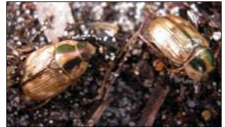
Adult oriental beetles

This pest is established in the eastern United States and is spreading slowly into the Midwest. Adult Oriental beetles vary from light brown to black with mottling on the wing covers.