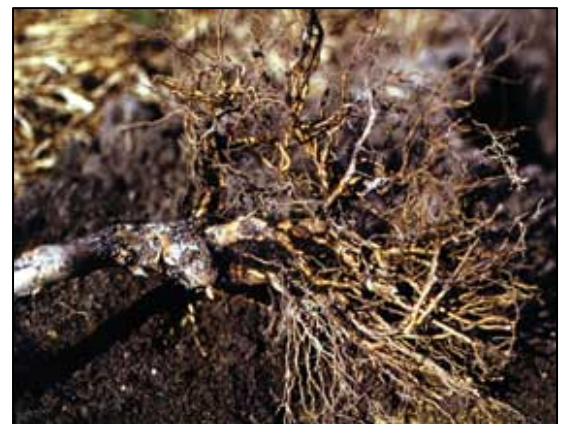
Roots damaged by Oriental beetle.

The female beetles lay eggs in the ground at the bases of bushes, and larvae feed directly on blueberry roots. Larvae are very similar to those of Japanese beetle , but the pattern of hairs on the posterior segment differs, with two parallel rows of 10 to 16 hairs per row. These can be seen using a hand lens, but for positive identification, we suggest sending samples to the MSU Diagnostics Laboratory to ensure an accurate identification. There are many similar-looking grubs and it is important to get a correct identificatio