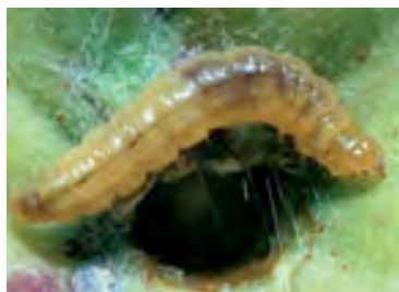
Redbanded leafroller larva

During a four year project in which commercial blueberry fields were scouted weekly for insect infestation, moth larvae were rarely found to be at levels exceeding a threshold of 2% of young shoots infested with larvae. Regular scouting was used to demonstrate that these insects were not present at levels requiring control. Management programs for fruitworms and other insect pests typically suppress populations of these insects.