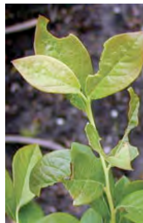
Foliage feeding by leafroller larvae