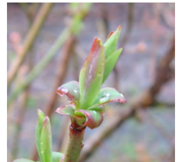
Figure 2. Water droplets on succulent developing leaf tissue provide suitable conditions for infection by mummy berry ascospores (West Olive, MI).

While shoot strikes were not seen, rainfall received in southwest Michigan last week and temperatures provided optimum conditions for ascospore release (around 57°F) and infection. In addition, freezing conditions may have predisposed shoots to infection by ascospores last week. Overhead irrigation for frost protection may also have contributed to leaf wetness for infection. Shoot strike symptoms typically appear about 12-14 days after the actual infection, depending on the temperature, so be on the lookout for shoot strikes in the next two weeks. Shoot strikes that are producing spores during bloom are epidemiologically most important since flowers have to be present for the fungus to complete its life cycle. If shoot strikes are observed and open blossoms are present, protect the blossoms from infection with a fungicide application (e.g., Indar or Pristine).