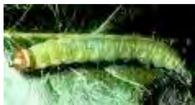
Obliquebanded leafroller larva (note the thoracic shield)