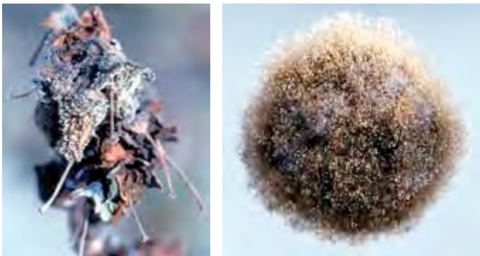
Figure 1. Blossom blight (left) and postharvest rot (right) caused by Botrytis cinerea .

Annually prune to remove infected twigs and to open canopy for good air circulation and fungicide spray penetration. Adjust timing and frequency of overhead irrigation to reduce plant wetness duration. Avoid late-season fertilization and practice good weed control. Apply fungicides from pre-bloom through the end of bloom if conditions are especially conducive to infection (cool and wet). The most effective fungicides are: Switch, Captevate, Elevate, Pristine, Rovral, Iprodione, Topsin M + Captan (or Ziram). Only apply Topsin M if a section 18 label has been granted.