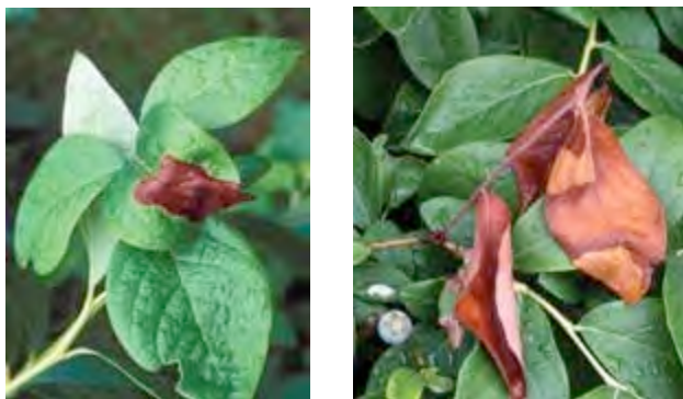
Figure 2. Leaf lesion (left) and twig blight (right) caused by Botrytis cinerea .