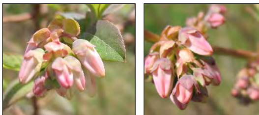
Bluecrop at mid to late pink bud in Grand Junction (left) and Jersey at mid pink bud in Covert (right).

In Van Buren County, Jersey in Covert is at mid pink bud, and Bluejay and Bluecrop in Grand Junction are at mid to late pink bud. In Ottawa County, Bluejay in Holland, and Rubel and Bluecrop in West Olive are at mid pink bud.