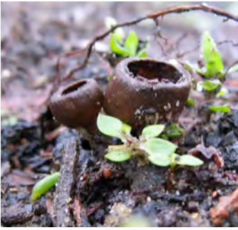
Figure 1. Mature apothecia observed in West Olive, MI.

Department of Plant Pathology, Michigan State University