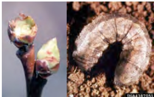
Left, cutworm damage, right, cutworm larva on soil.

Before bloom, growers may notice caterpillars crawling on stems. There are a few main groups of these moth larvae, and scouting for these and knowing what to look for can help avoid economic damage.