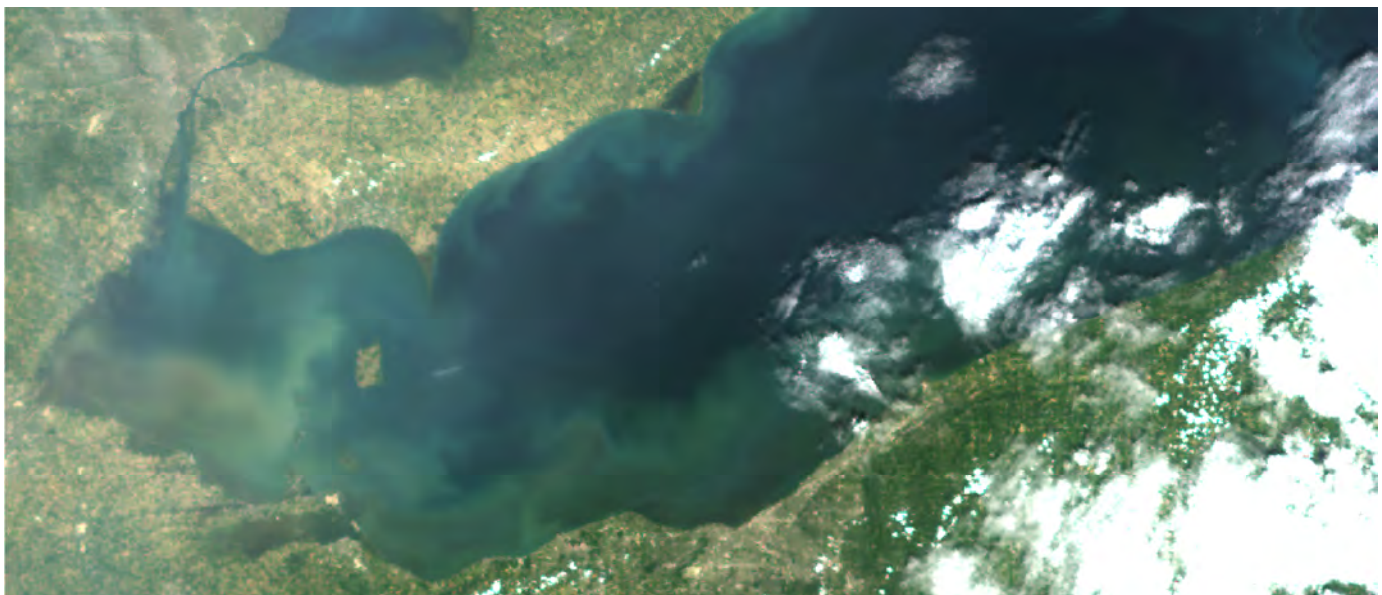
Figure 3: MODIS Tera true color image from July 6, 2015. Sediment in the lake is still suspended from recent storms. The high discharge in the Maumee River has also introduced sediment into the western basin, with the high sediment concentrations along the Ohio coast between Toledo and Sandusky.