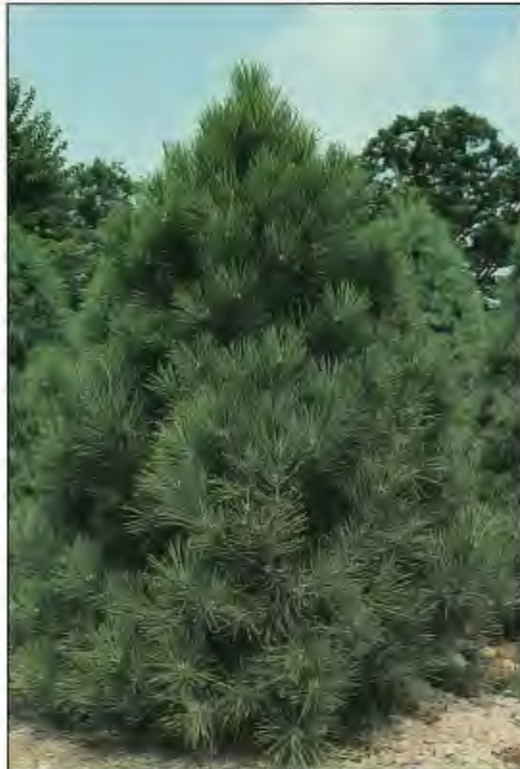
Figure 4. Austrian pine can be managed to produce an attractive Christmas tree. Its stiff foliage and strong branches make it particularly desirable for flocking.