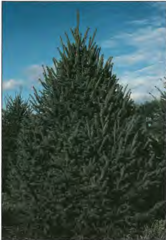
Figure 7. White spruce has attractive foliage and a pleasing natural shape. While popular in some choose-and-cut operations, it is less commonly planted for the wholesale market.