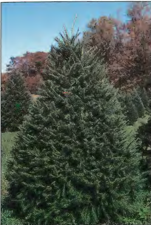
Figure 13. Douglas fir of Rocky Mountain seed origins will grow satisfactorily in many areas of the North Central states. It is characterized as a symmetrically shaped tree which has soft, fragrant foliage.