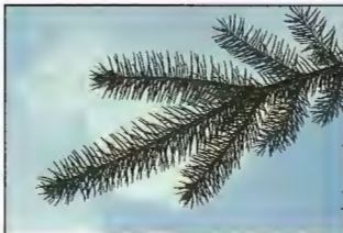
Characteristic Colorado blue spruce needle/twig pattern