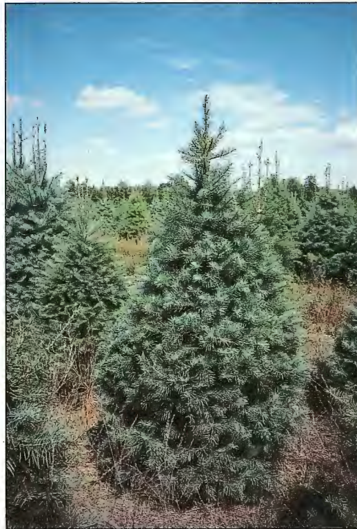
Figure 12. Concolor or white fir grows well in plantations if effective weed control is present. Its long, silvery-blue needles, combined with excellent fragrance, contribute to its increasing popularity.