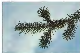
Characteristic Douglas fir needle/twig pattern.