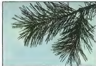
Characteristic Scotch pine needle/twig pattern.