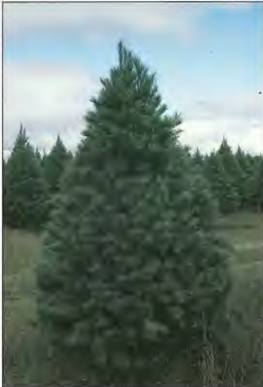
Figure 3. Southwestern white pine is characterized by attractive blue-green foliage. It is not widely planted because of difficulty in developing trees with full, uniform foliage.