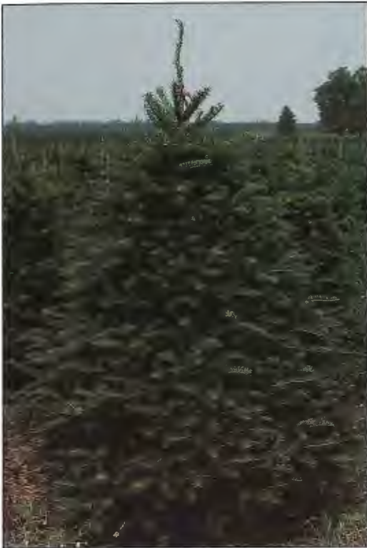
Figure 11. Canaan fir has been successfully established in plantations in portions of the North Central region. It is well adapted to somewhat poorly drained soils and to areas where late spring frosts occur.