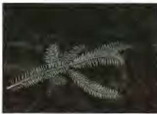
Characteristic Fraser fir needle/twig pattern.