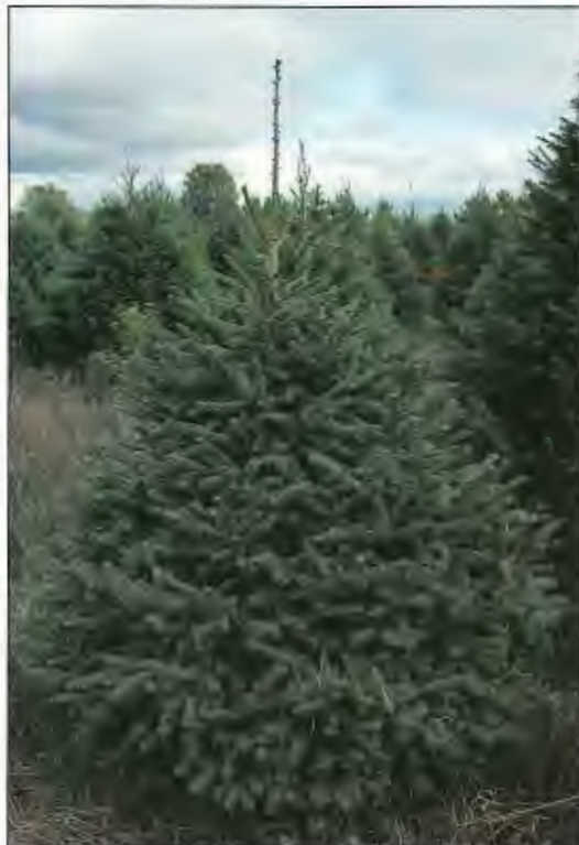
Figure 8. Spartan spruce is new in the Christmas tree industry. This hybrid between Colorado blue spruce and white spruce is characterized by the bluish color of blue spruce and the soft foliage and faster growth rate of white spruce.