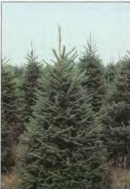
Figure 9. Fraser fir has become an increasingly popular Christmas tree in the past several years. Its attractive foliage, fragrant aroma and excellent needle retention characteristics have contributed to increases in annual plantings.