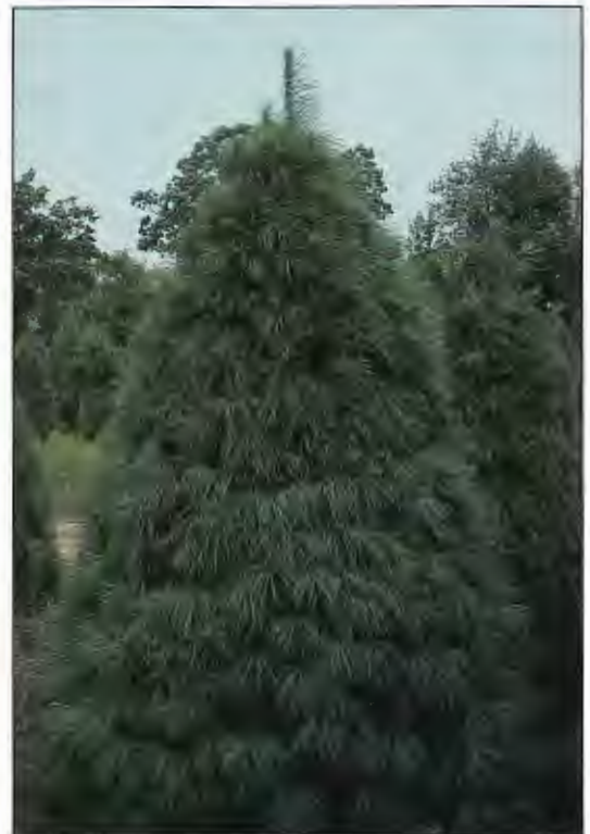
Figure 2. Eastern white pine responds well to shearing to produce an attractive tree with uniform foliage. Its soft foliage and symmetrical branching habit contribute to its pleasing shape and popularity.