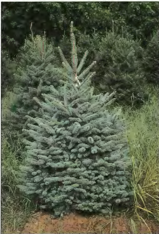
Figure 5. Colorado blue spruce is widely planted throughout the region. Its attractive foliage and pleasing natural symmetry contribute to its increasing popularity as a Christmas tree.