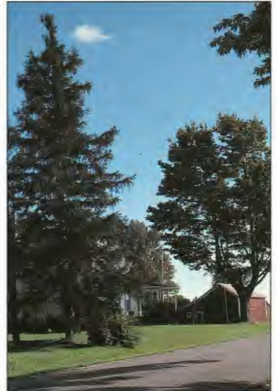
Figure 6. Norway spruce has been widely planted for ornamental purposes. Its popularity as a Christmas tree has declined due to poor needle retention.