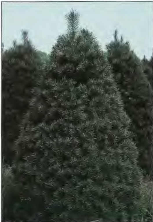
Figure 1. Scotch pine represents the most widely planted species throughout the North Central region. When managed intensively, marketable trees can be produced within 7 to 8 years.