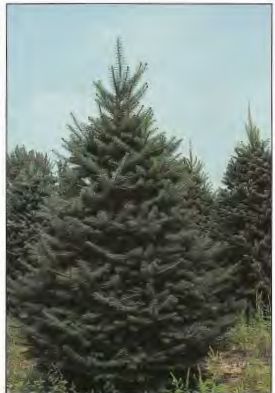
Figure 10. Balsam fir has long been the traditional Christmas tree in northern areas of the United States. This native species grows well in plantations where management provides adequate fertility and freedom from competing vegetation.