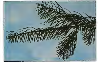
Characteristic Concolor fir needle/twig pattern