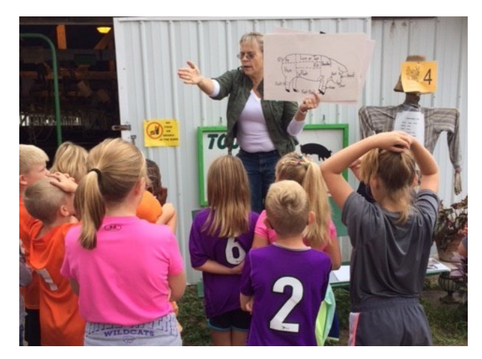
Swine presentation during the 28th annual Ag-Citing Experience.

The annual "Ag-Citing" tour is definitely a "hands on" experience! The Sturgis Public Schools returned to the event this year bringing over 200 students to the event.