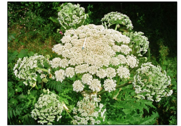
This giant hogweed leaf is 3 feet long. At right, a flower.

be 2.5 feet wide. The plant flowers from June to August in Michigan.