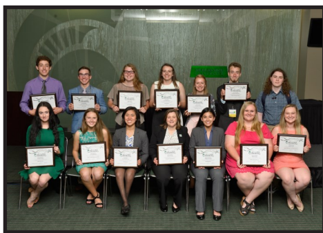
2019 State Award winners with their plaques at 4-H Exploration Days.