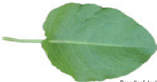
Broadleaf dock leaf.