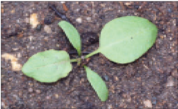
Curly dock seedling.