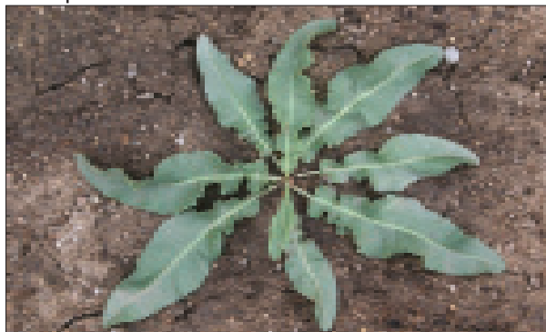
Curly dock rosette.