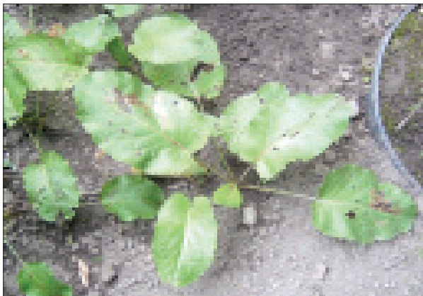
Broadleaf dock rosette.

Differs by having much wider, broader leaves and usually heart-shaped leaf bases.