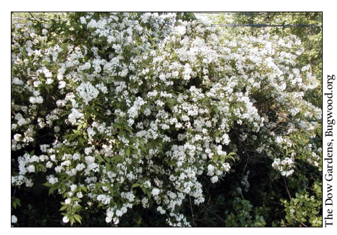
Common ninebark with abundant flowers.