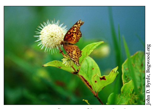
Unique summer flowers of buttonbush.

Here are a few examples of native trees and shrubs to consider for Michigan landscapes.