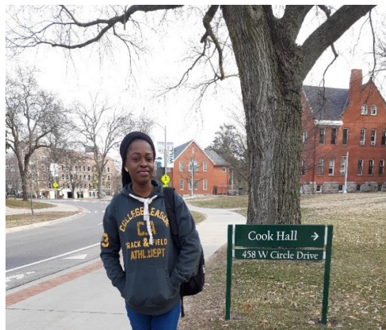
In Front Of Cook Hall