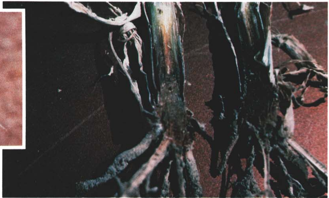
Fig. 3 A healthy, viable growing point (left) and a nonviable growing point (right). Any darkening or softening of the growing point indicates a nonviable (dead) plant.

Next, determine if remaining plants are viable. Plants that have a live growing point (white or cream colored) are considered viable. Dig up a few plants in the damaged area, split each stalk lengthwise with a sharp knife and examine the bottom portion of the stalk to check the growing point. Any darkening or softening of the growing point indicates a nonviable plant. Figure 3 shows a healthy, viable (left) and a non-viable (right) growing point. Since it is sometimes difficult to distinguish a live from a dead growing point immediately after the damage, it may be necessary to wait five to seven days and observe whether plant regrowth has occurred. If no regrowth is visible after seven days, consider that plant dead.