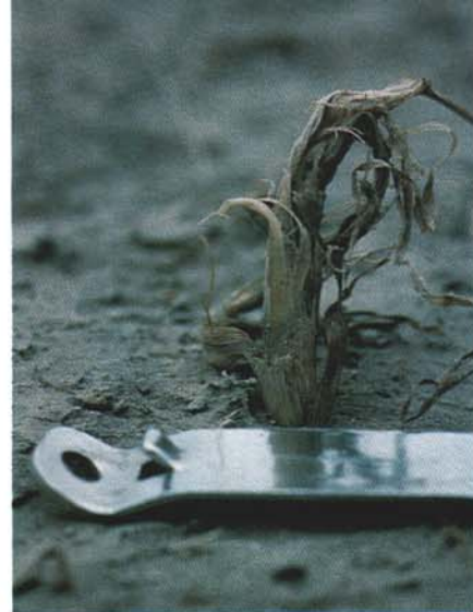
Fig. 2 To determine if a damaged stand will regrow, examine several damaged plants to see if the underground growing points are alive (see Fig. 3), or wait five to seven days to see if the plants initiate growth.

To estimate stand loss, you must count the remaining viable plants and know the plant population before the damage. To determine the healthy plant population remaining, mark off