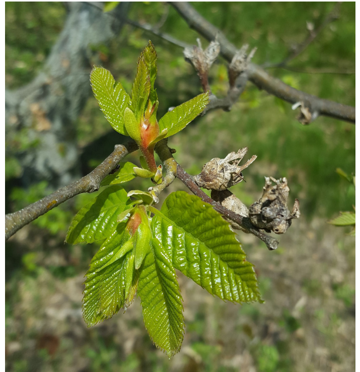
Figure 7. New galls (orange color) caused by the Asian chestnut gall wasp along with old, dried galls from the previous year.

Insecticide sprays. If galls are abundant and especially if nut production is low on heavily infested trees, you may need to control ACGW adults with a cover spray of a broad spectrum, conventional insecticide. If a cover spray is needed, correct timing and adequate coverage are essential. Correctly timing sprays is critical to ensure effective control of the pest and to minimize the effects on an important biocontrol agent (see below) and beneficial pollinators. Insecticide sprays will have no effect on immature stages of the ACGW, which are protected within galls.