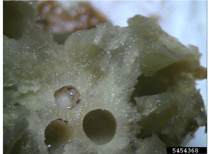
Figure 5. Cross section of a gall with two empty chambers and one chamber containing an Asian chestnut gall wasp pupa.