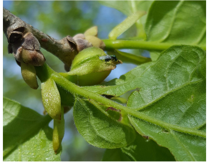
Figure 8. An adult Torymus sinensis parasitoid wasp on a gall caused by the Asian chestnut gall wasp.

The T. sinensis parasitoid and the ACGW share a long co-evolutionary history in China, where the life cycle of the parasitoid is well synchronized with the ACGW. In early spring, as ACGW galls are forming, T. sinensis adult females lay an egg into individual gall chambers where an ACGW larva is feeding (Figure 8). Each parasitoid larva feeds on an ACGW larva within the gall chamber throughout the summer, eventually killing it. Parasitoid larvae then remain inside the galls throughout the winter. As chestnut buds break and new galls form in the spring, adult parasitoid wasps emerge from the dry, previous-year's galls to oviposit within the green, succulent, current-year galls.